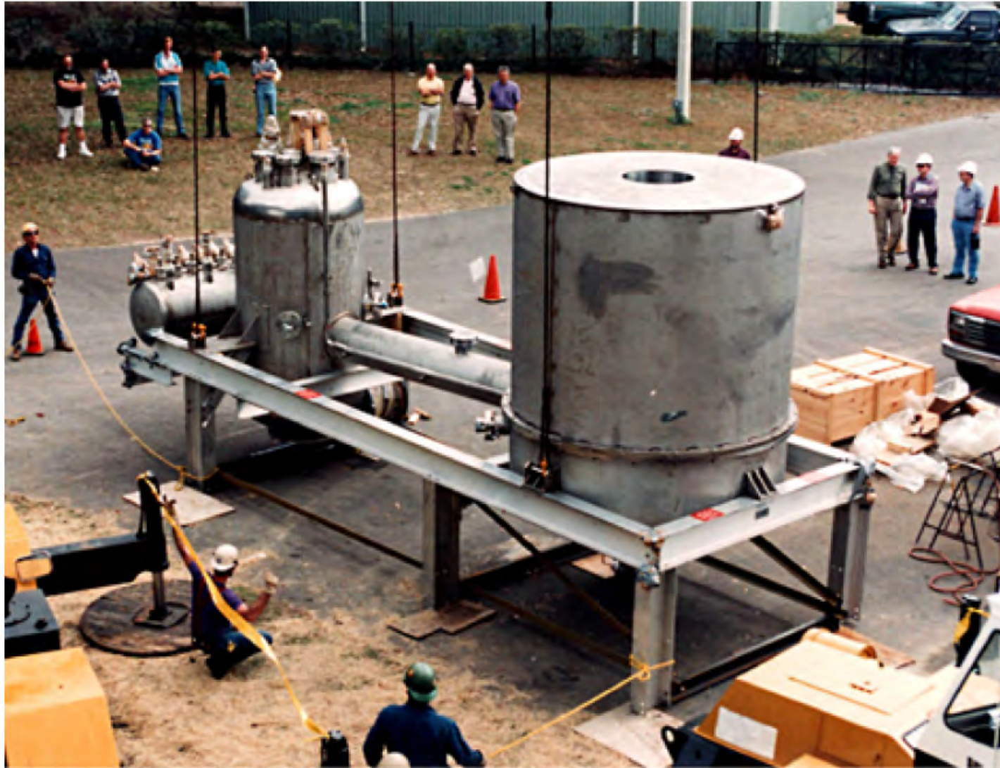
Arrival of 45 T hybrid magnet cryostat at the National High Magnetic Field Laboratory, Florida State University, Tallahassee